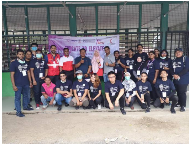
Group Members and BSMM Members

: It was very successful program. The reason we did the basic health screening is to detect abnormalities that the person is not aware of and provide important information for diagnosis, treatment or preventive measures for illnesses and diseases for the people in Kampung Orang Asli Donglai Baru, Semenyih, so that people there can get relevant information on health problems.