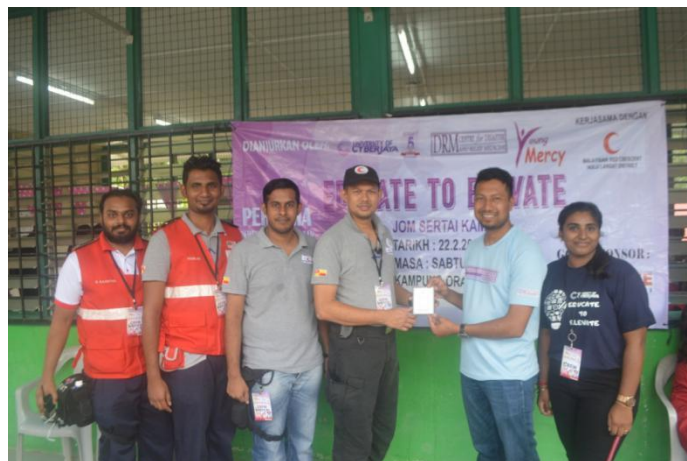
Souvenir given by our advisor