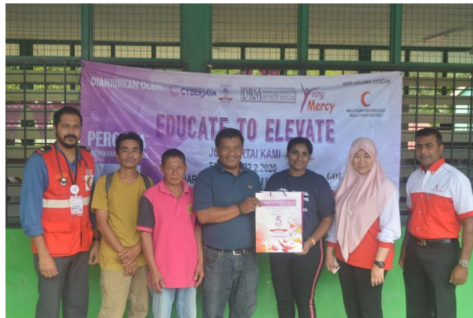
Leader giving goodie bag