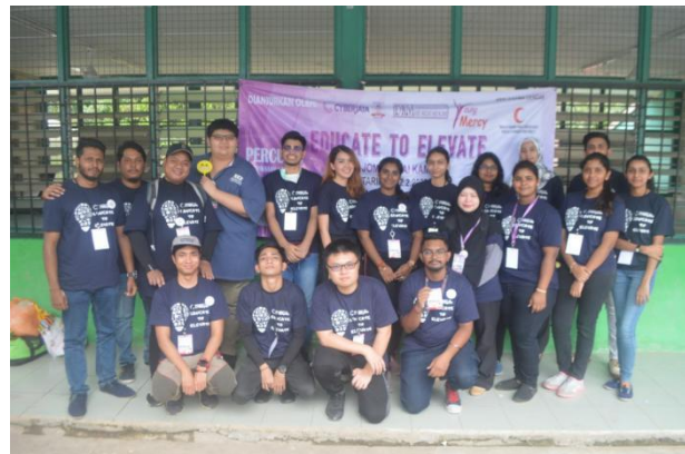
Young Mercy Group Members