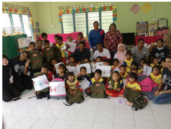
Children of Kampung Orang Asli Donglai Baru