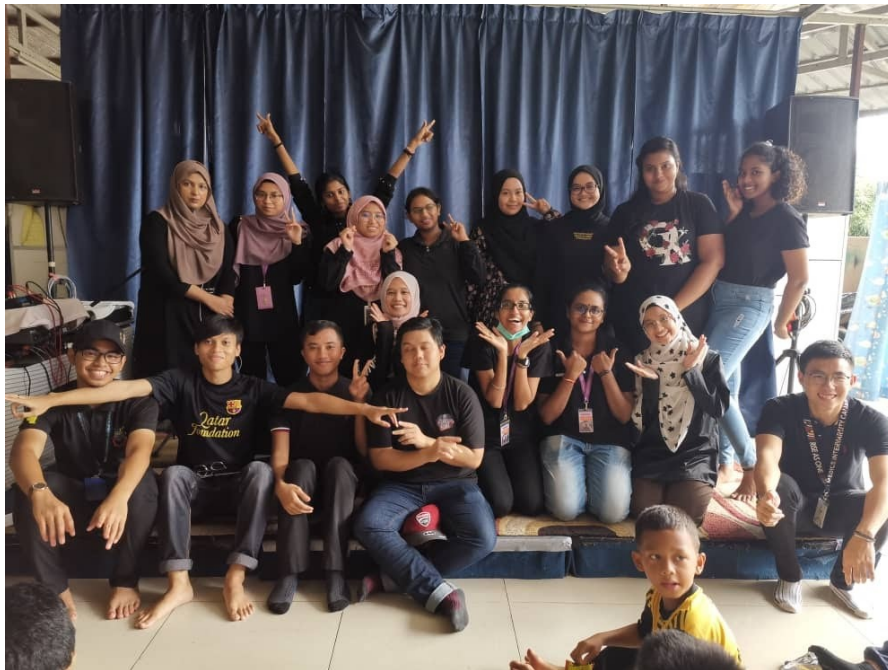
The committee members